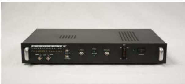
New PiezoMEMS Analyzer