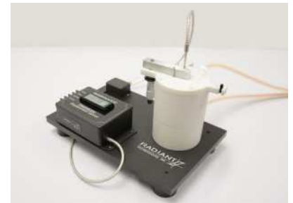
Non Heated Piezoelectric Test Bundle for Bulk Ceramics

The Bulk Ceramic Piezoelectric Test Bundle is rated to 10kV. Allows piezoelectric displacements (converse d33 measurement) on the order of one micron or larger using Radiant Testers. Includes a Piezoelectric Displacement Sensor, Piezoelectric Measurement Test Fixture, and Advanced Piezoelectric Software. The Sample Chamber is rated to 10,000 Volts.