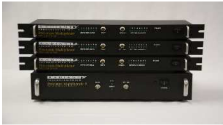
Radiant Tester with Multiplexer

The MUX 2018 is its own stand-alone USB controlled instrument and can test hot or cold temperatures.