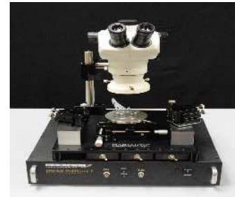
Radiant Tester with Probe Station

Simple Test Station is a small yet reliable and stable test station for laboratories. It is provided without optics.