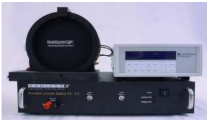
Radiant Tester with Magneto Test Bundle

Radiant’s Magneto-electric Test Bundle allows users to set DC Magnetic Fields across a sample using any coil and adjust those fields while a test progresses under Vision Software.