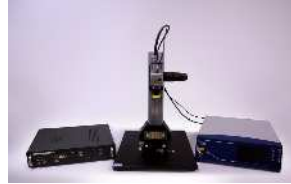
Radiant Tester and Polytec VibroOne Laser

Radiant Technologies offers two tools that together enable the characterization and control of piezoelectric films during product development and manufacturing.