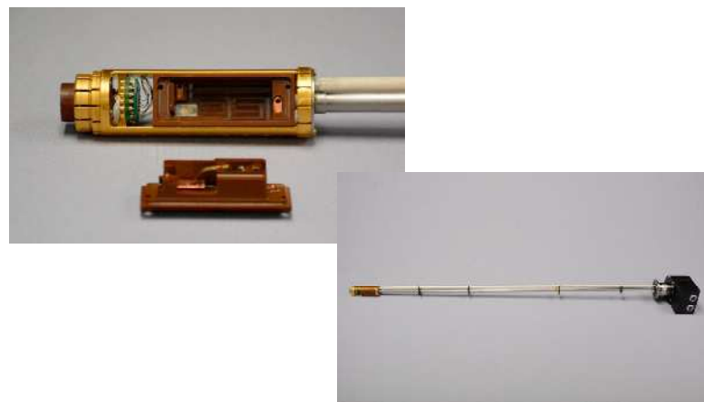
High Voltage Cryogenic Probe (HVCP) compatible with Quantum Design PPMS

Measurements above 1,200 volts up to 4,000 volts may be executed without breakdown if the chamber is placed in High Vacuum mode.