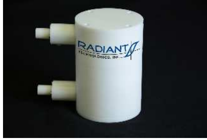
High Voltage High Temperature Test Fixture

Radiant offers several test fixtures that range from 230°C to 650°C rated to 10kV. These test fixtures can be used at room temperature, with silicon oil, or in a chamber or furnace.