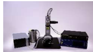
Radiant Tester, Polytec VibroOne Laser and Thermal Stage

e31 characterization to track film piezoelectric coefficients.